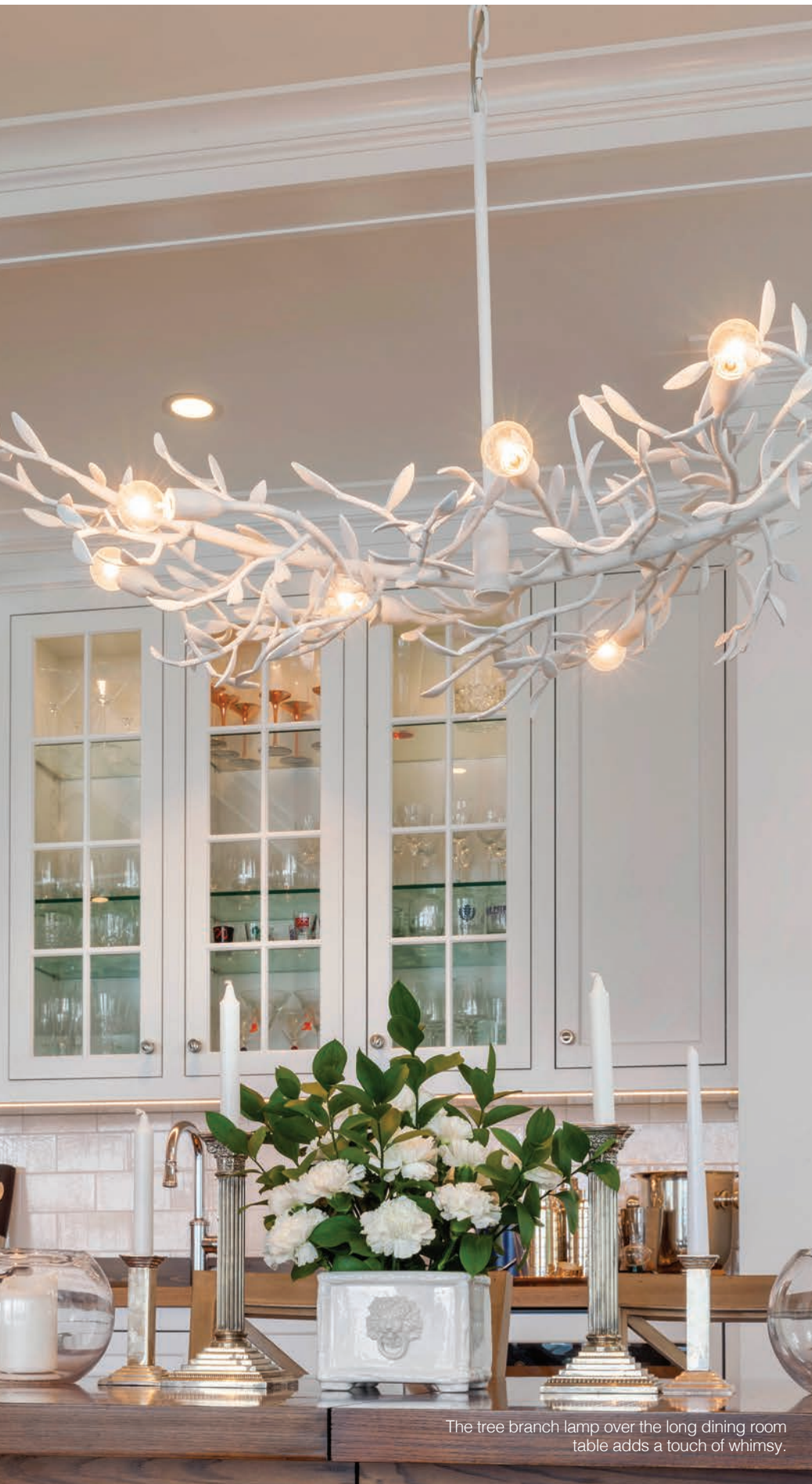
The tree branch lamp over the long dining room table adds a touch of whimsy.