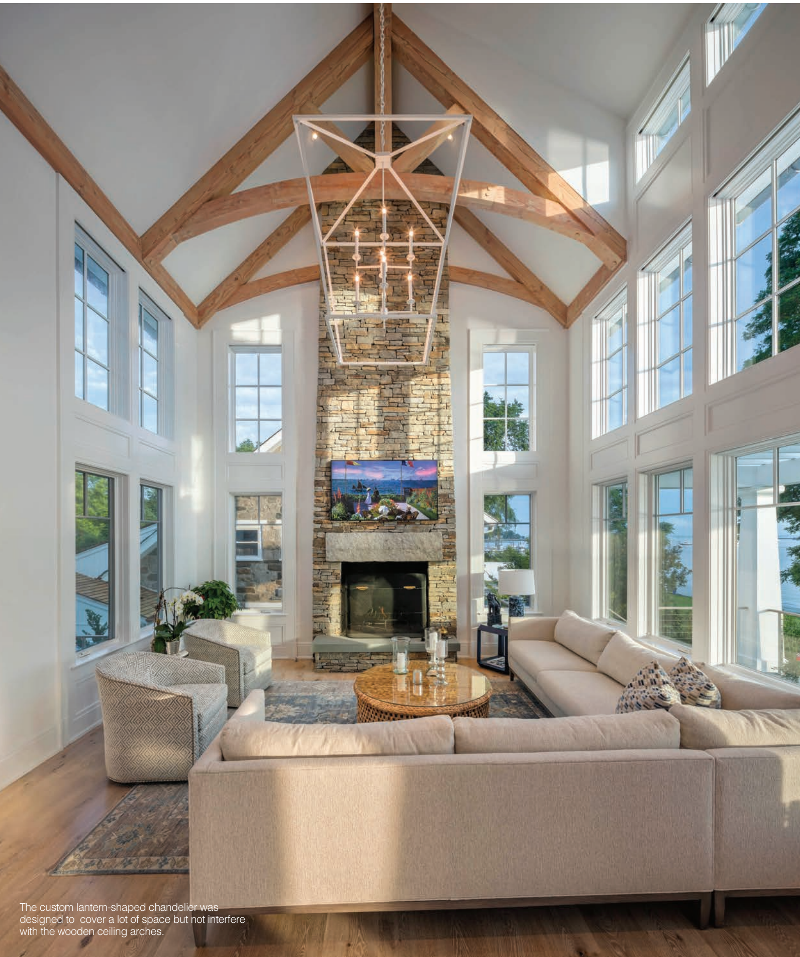
The custom lantern-shaped chandelier was designed to cover a lot of space but not interfere with the wooden ceiling arches.