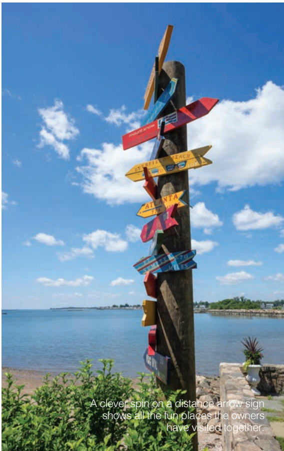
A clever spin on a distance arrow sign shows all the fun places the owners have visited together.

make the house look grounded, not like it was up on stilts,” she continues. The answer was creating a garage and storage area for recreation and boating supplies on the ground level, with the lifted first floor directly above it.