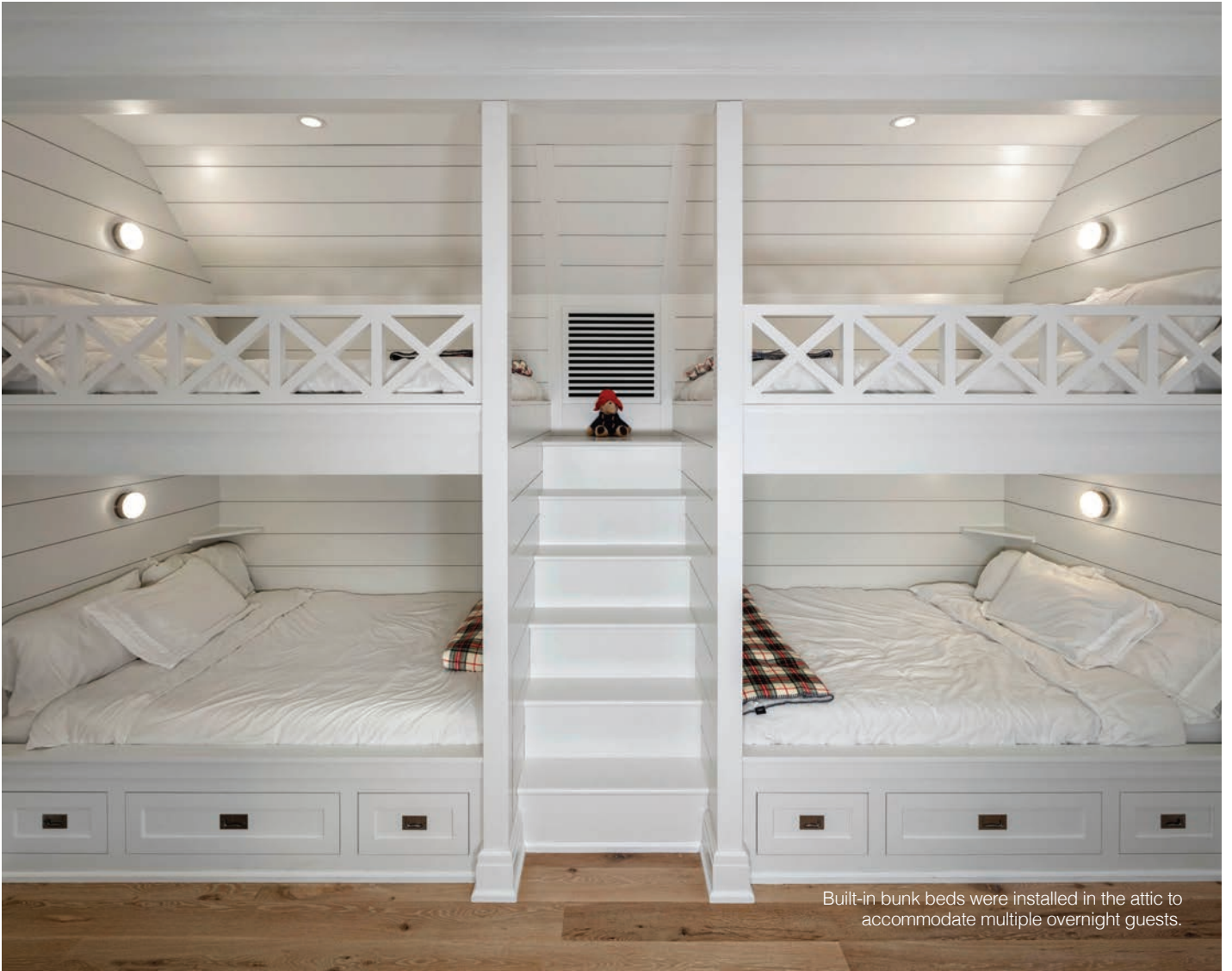
Built-in bunk beds were installed in the attic to accommodate multiple overnight guests.