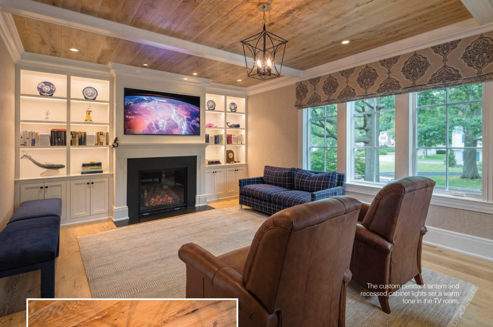
The custom pendant lantern and recessed cabinet lights set a warm tone in the TV room.