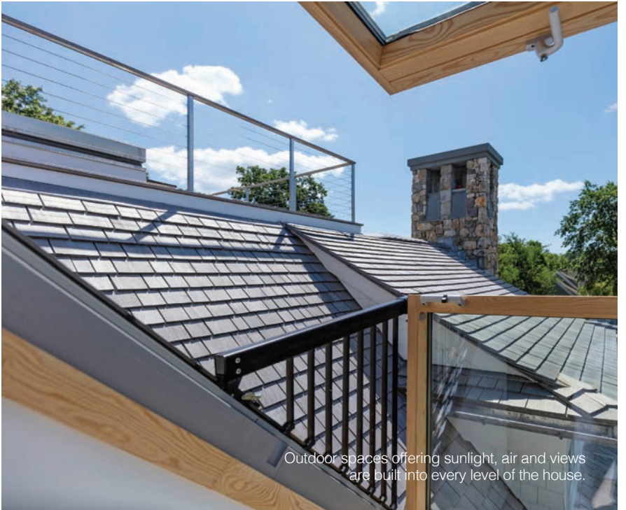
Outdoor spaces offering sunlight, air and views are built into every level of the house.