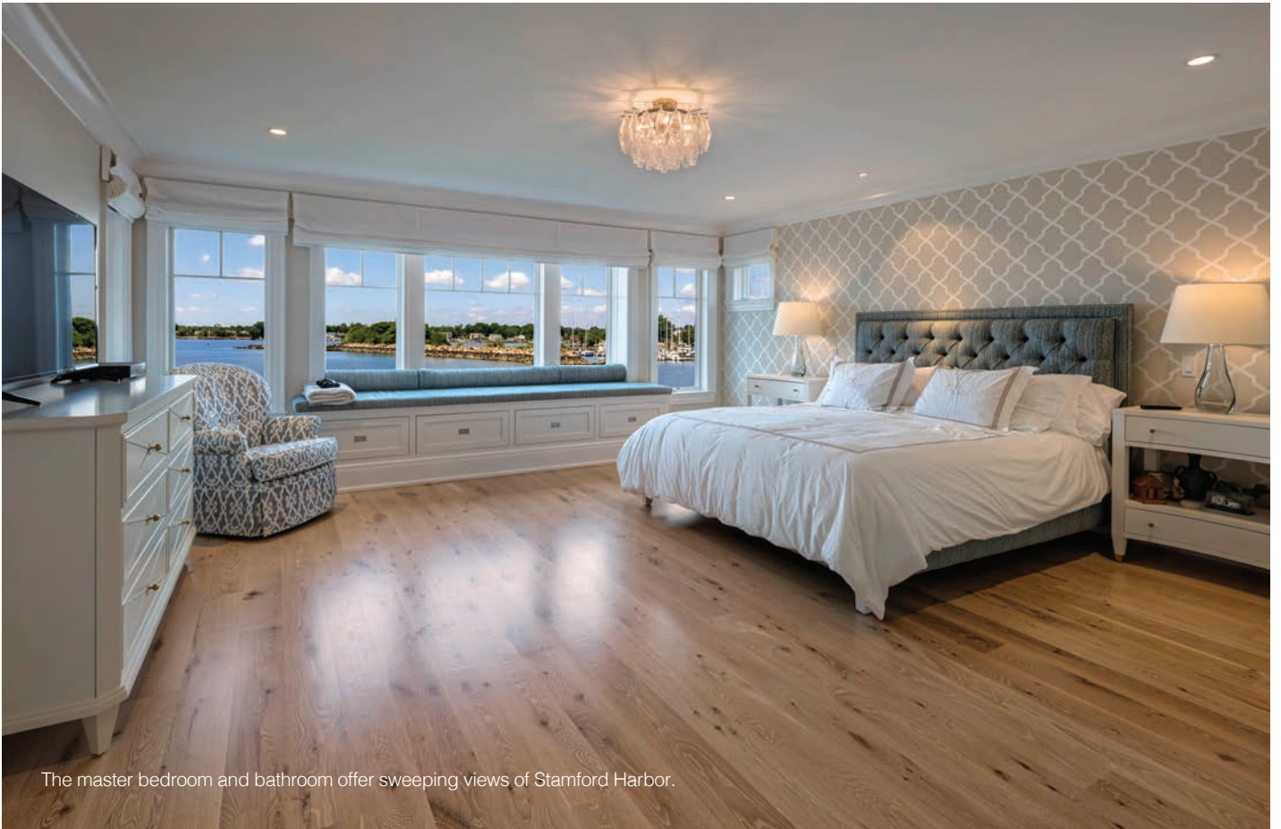
The master bedroom and bathroom offer sweeping views of Stamford Harbor.