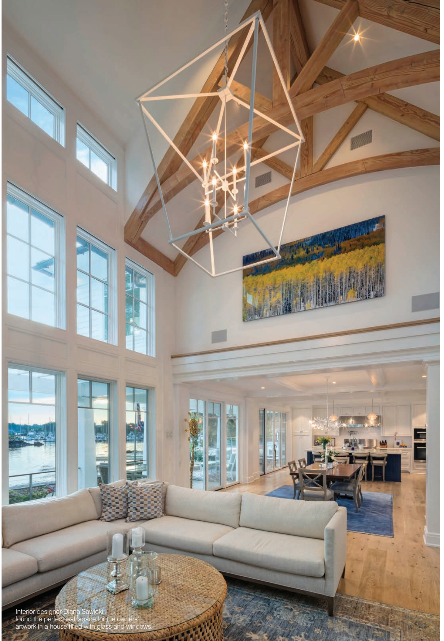
Interior designer Diana Sawicki found the perfect wall space for the owners' artwork in a house filled with glass and windows.