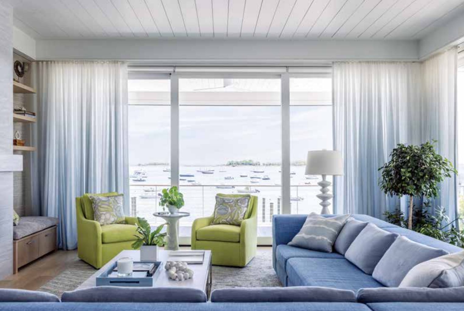
Spring greens, purple, natural oak, white, and a few subtle patterns like the one on the dining chairs complement the blues throughout. FACING PAGE, TOP TO BOTTOM: On the main level, the family room, kitchen, and dining area are open to one another and enjoy views out to the water. The residence is dubbed “the hydrangea house” after the wife’s favorite color, hydrangea blue, which appears on the kitchen cabinetry and range hood.