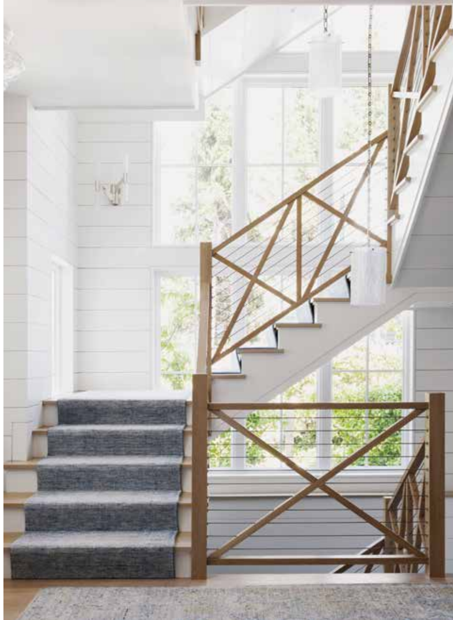
Designed with outdoor entertaining and activities in mind, the lower level leads to a firepit and the waterfront; both the grotto area and the deck on the main floor can be enclosed by screens that lower from the ceiling. FAR LEFT: A nautical-inspired cable-and-wood staircase connects all four floors.