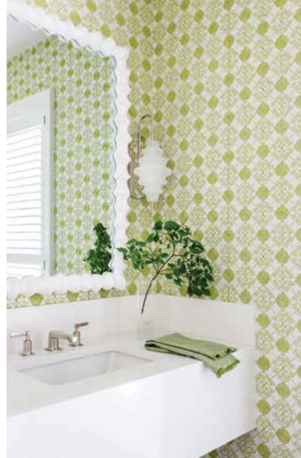
CLOCKWISE FROM LEFT: The primary bath features a Victoria + Albert soaking tub, Artistic Tile flooring, and Watermark fixtures. A powder room is sheathed in a wallpaper by Crezana, the mirror is from Oly, and the sconces are from Visual Comfort. The vanity in the primary bath is the same shade of blue as the showstopping tub. FACING PAGE: When it came to the primary bedroom, the clients amended the original plan to accommodate a vaulted ceiling. A Brightbound light fixture adds another layer of texture, and the painting by Catherine Erb is from KMR Arts.

The residence is now dubbed “the hydrangea house,” says the client.